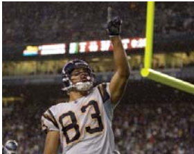
Score by Quarters San Diego Chargers Seattle Seahawks

game, completing only one pass in the first half, but it was good for a nine-yard touchdown pass to Jackson that gave the Bolts a 7-0 lead...Kaeding added his two field goals in the third quarter, but two second-half touchdowns by Shaun Alexander and a late fourth quarter field goal by Josh Brown allowed Seattle to take a 17-13 lead...after the field goal, the teams traded possessions late in the game and the Seahawks had a chance to get a first down and run out the clock deep in their own territory, but a three-and-out by San Diego's defense forced a punt and set the stage for the dramatic comeback in the final two minutes of the game...Rivers led the offense 59 yards in five plays and capped off the game with the touchdown pass to Jackson.